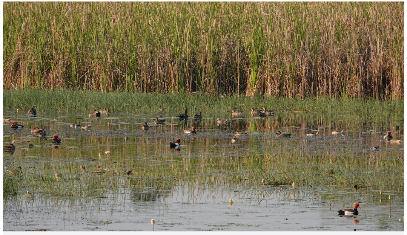
Figure 3 - The wetlands of Navegaon Reservoir to the northwest of the COCOON area attract thousands of migratory waterbirds.

ists in search of real nature experiences. The Sanctuary Nature Foundation and the COCOON Conservancy form a key part of a wildlife corridor that acts as a staging ground for tigers moving across a landscape that extends over 3,000 sq. km (1,158 The sq. miles). The COCOON pilot itself comprises privately owned land outside the buffer zone of the protected UPKWS forest, which is managed by the Maharashtra State Forest Department.