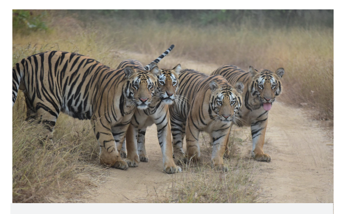
Figure 5 - The 189-sq.-km (73 sq. mile) expanse of Umred Pauni Karhandla Wildlife Sanctuary offers fairly good opportunities to see tigers and other mammals.