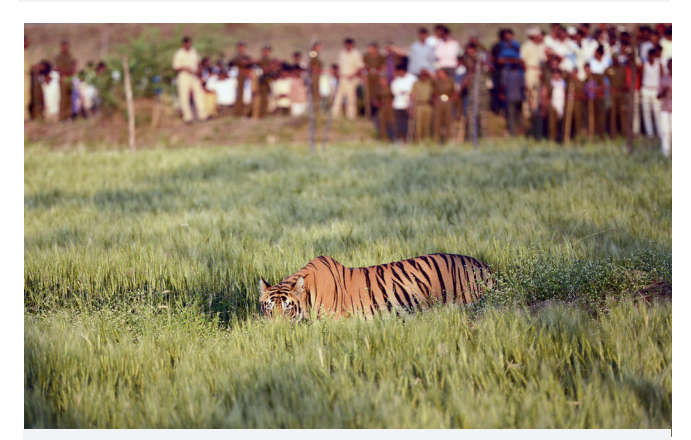
Figure 6 - Human-animal conflicts will soon be a thing of past as COCOON offers additional spaces for biodiversity to flourish and disperse.

Nagpur district. He has only one dream - to protect tigers and their habitats. His drive, purpose, and single-minded devotion will certainly give the tigers of Umred-Karhandla and Tadoba an extra edge on life.